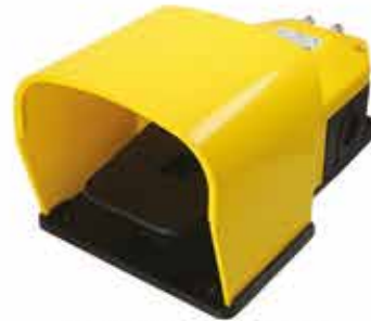
Foot-treadle remote control Code: PEDAL-101